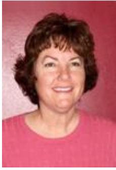
The Presidents Message